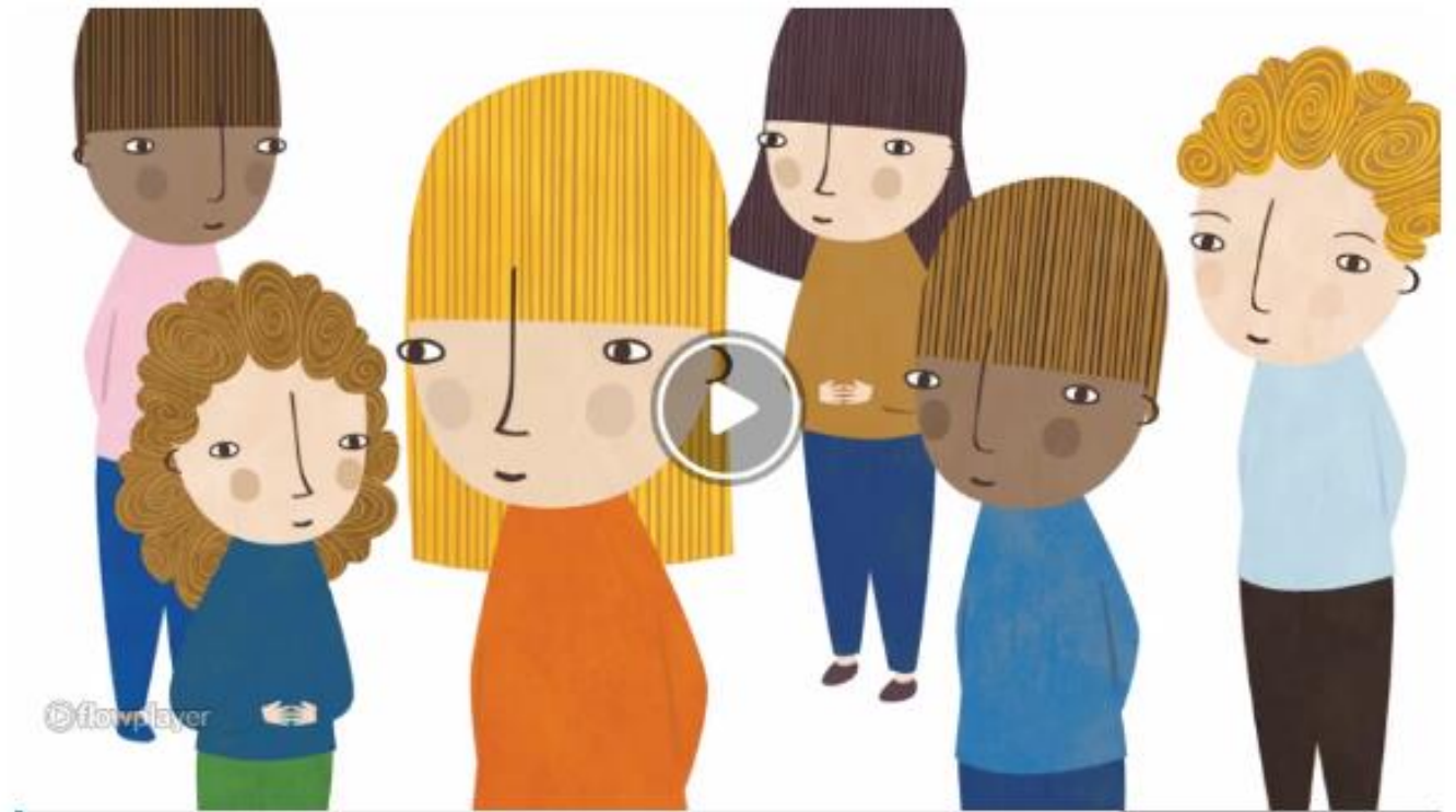
Video: Identifying signs of abuse